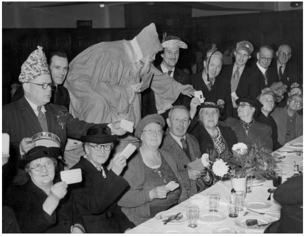
"Old folks" Christmas party at York Hall, Bethnal Green, 1949.

Please email your captions to localhistory@towerhamlets.gov.uk by 31st December 2013. The winning entry will receive a copy of "Good morning brothers!" by Jack Dash.