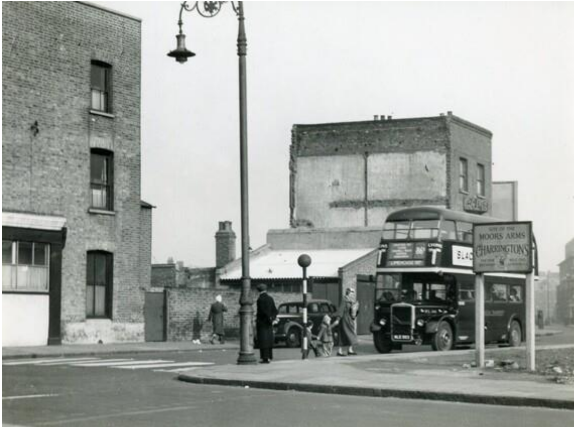
Bow Common Lane at the junction with Devon's Road. This photo, dating from the 1950s, shows the 86 bus and the site of the Moor's Arms pub. Ref no: P00934