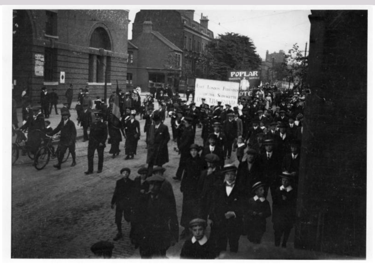
East London Federation of Suffragettes march past Bow bus garage.

Tower Hamlets Council in partnership with Jewish Care is hosting a range of free events to mark Holocaust Memorial Day in the borough. Please click <u>this link</u> to access the full programme.