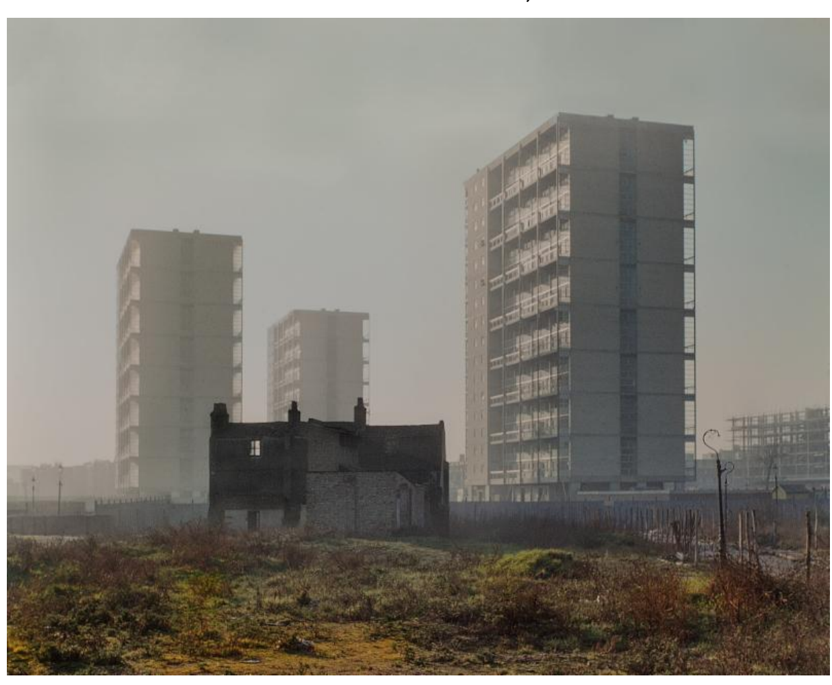
The Stifford Estate, Stepney, 1961

David Granick: The East End in colour, 1960-1980