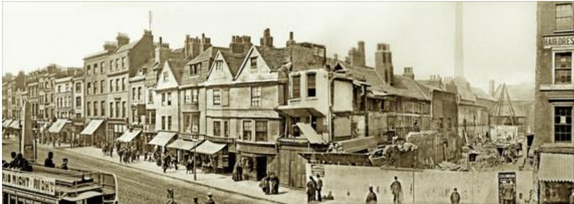
Composite photograph (P34255) created by combining two separate images held in our collections.

This evocative panorama shows the north side of Whitechapel High Street in circa 1890.