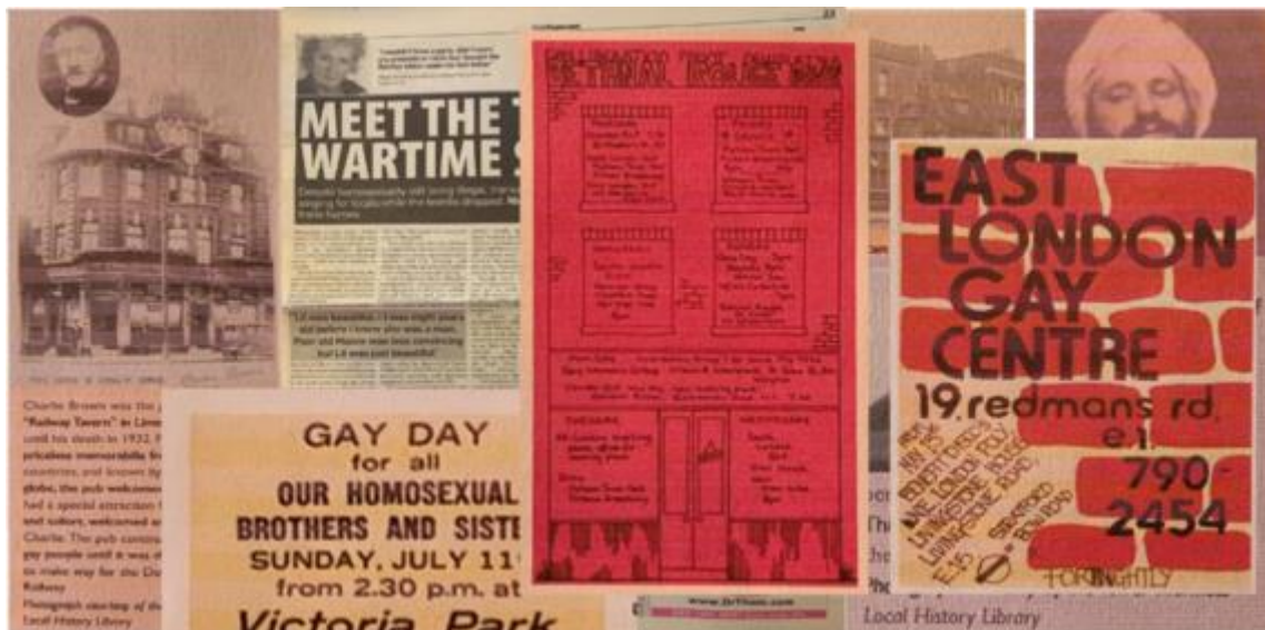
Montage of LGBTQ materials from THLHLA collections.

FREE EVENT via Zoom. To reserve your place please email: lgbtforum@elop.org You will be emailed the joining instructions prior to the event.