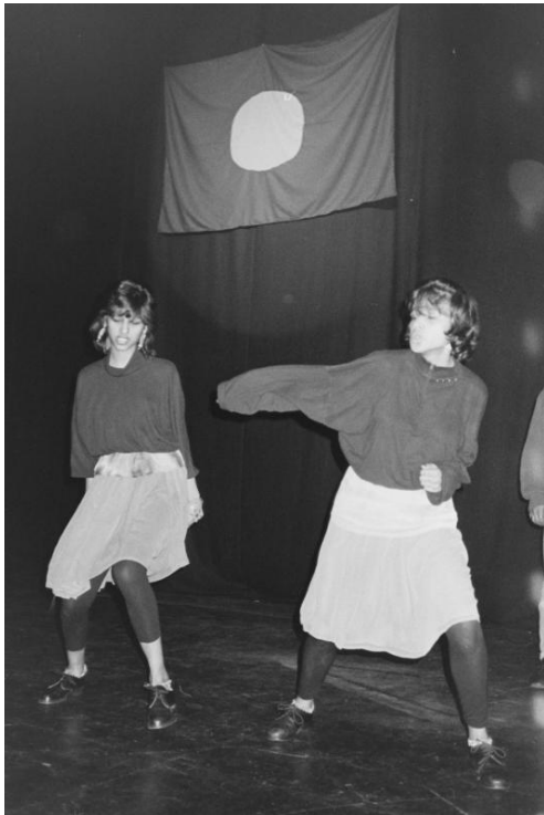
Joi Bangla Krew dancers at the Half Moon Theatre, Mile End Road, 1986

More events for Women's History Month in March are in the pipeline - look out for our next newsletter.