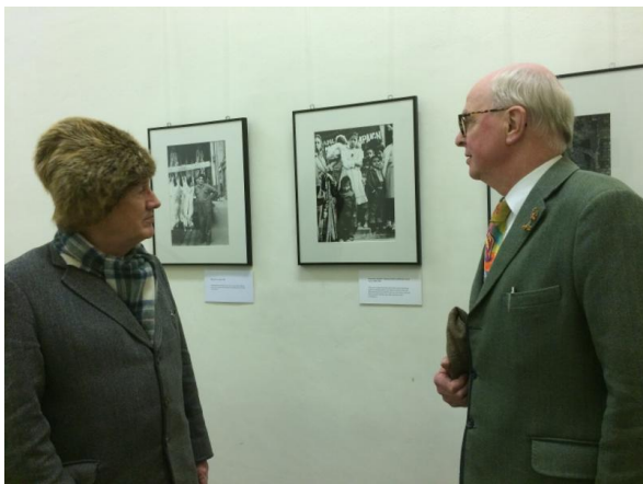
Gilbert & George at the Brick Lane Born exhibition launch, October 2016

We have a particularly exciting January coming up with the launch of our next exhibition Stages of Half Moon . Read on for further details, plus news of our events programme about the East End's theatre history and our Holocaust Memorial Day film screening.