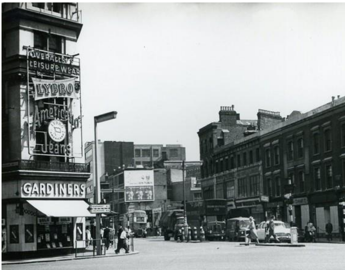
Gardiners Corner, 1963 (P02347)