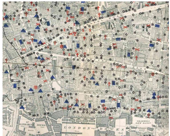
Section of a map from Booth's Life & Labour... (1899-1900) showing licensed premises, schools and places of worship