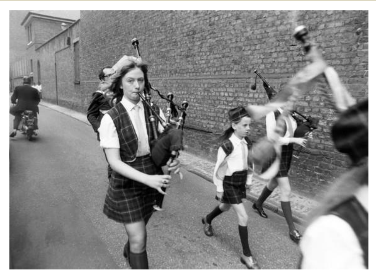
Photograph of fife and drum band parade in Wapping, 1980s