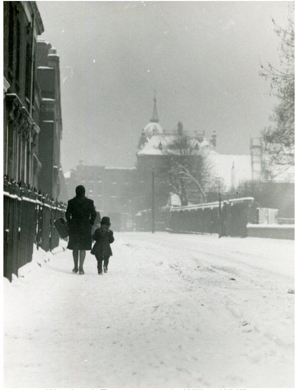
Woodstock Terrace, 1957, by William Whiffin

We have by popular demand produced a superb pack of postcards of photographs by William Whiffin which featured in our recent exhibition, Whiffin's East End . The pack of 12 postcards costs just £5 with £1 of the price going towards conserving Whiffin's photography collection.