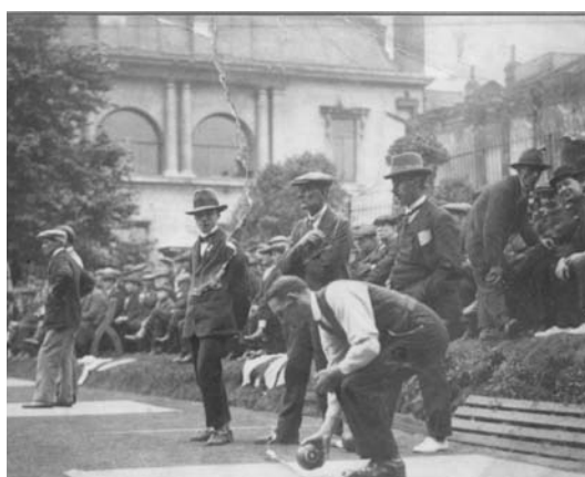
Photo of Poplar Bowling Green, c 1926

Just launched, the new Winning Endeavours website is a rich digital resource for those interested in London's Olympic past. We contributed twenty images from our collections including views of the 1991 Marathon through Canary Wharf, ballooning at Poplar Recreation Ground and Victorian football at Millwall. The digital gallery also includes contributions from twenty five other repositories. Browse the images at www.winningendeavours.org