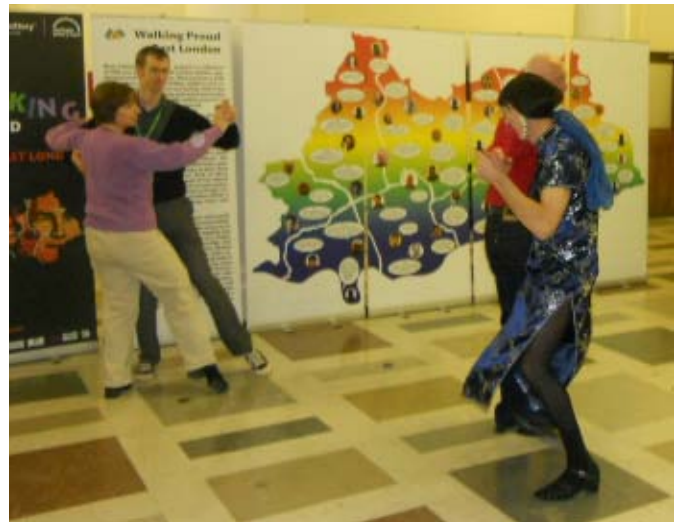
A tea dance in the library

The first exhibition in the newly redecorated entrance hall was hosted by Isle of Dogs-based community arts group River Cultures. Their Heritage Lottery Funded Walking Proud in East London project, which collected and preserved the testimonies of lesbian, gay, bisexual and transgender East End residents across seven London boroughs, including Tower Hamlets was exhibited at the library for two weeks during LGBT