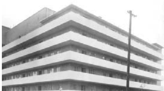
John Scurr House, c1937