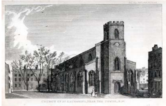
Frontispiece engraving of 1825 Saint Katherine's Church auction catalogue