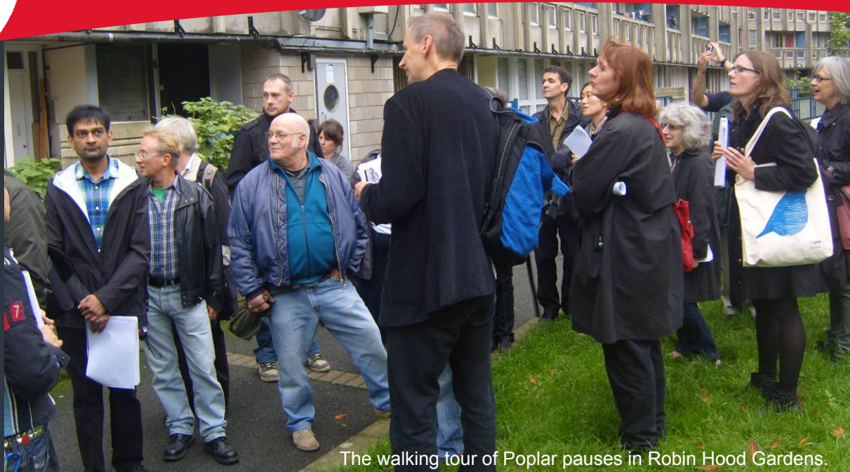
The walking tour of Poplar pauses in Robin Hood Gardens.