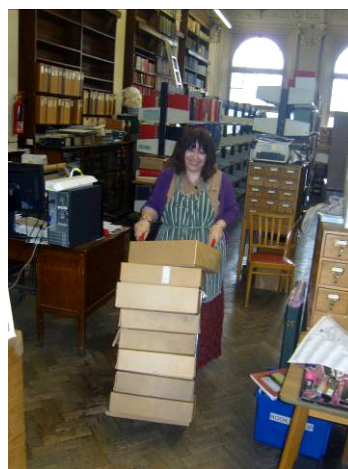
Collections on the move!

The Mayor indicated his support for the building's redevelopment as a heritage centre and was pleased with the progress so far. He even suggested a Cabinet meeting should be held in the currently vacant former lending library! We hope to welcome the Mayor back to open our first exhibition early in the new year.