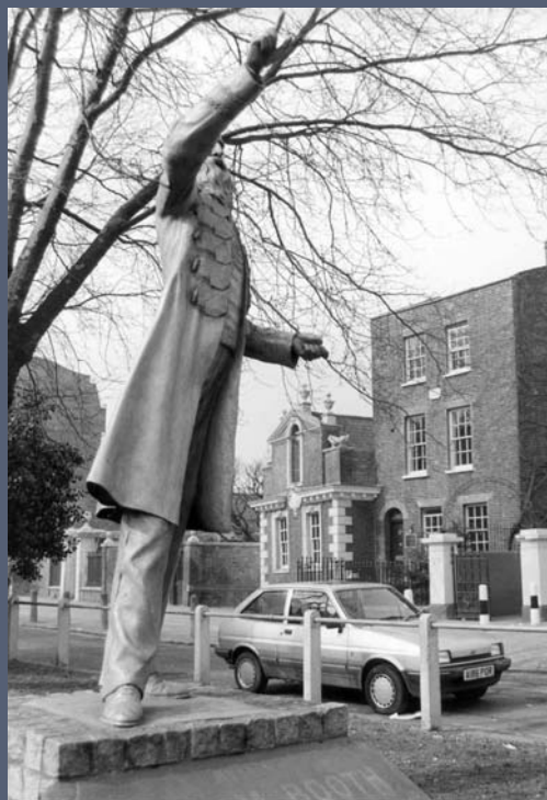
Statue of William Booth in Stepney

The papers of William Booth, who founded the Salvation Army in Stepney in the mid-nineteenth century, have recently been catalogued. They are available for consultation by researchers at the Salvation Army Heritage Centre in Camberwell, south London, from the end of February 2010. Copies of the Booth catalogue and of the papers of the East London Christian Mission are now available for reference in Tower Hamlets Local History Library & Archives. For more information on the history of the Salvation Army, please visit www.salvationarmy.org.uk/heritage