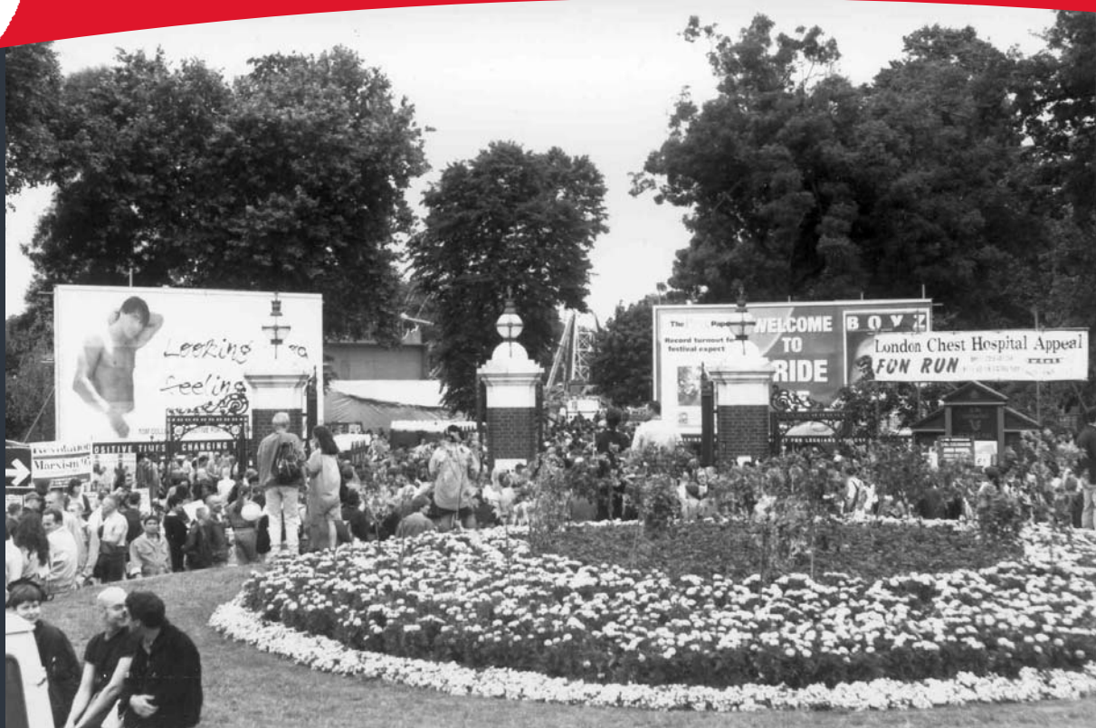
Gay Pride Festival Victoria Park 1995