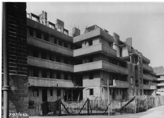
Ring House, badly damaged

but such images as the construction of air raid shelters in King Edward VII Memorial Park and a badly damaged Ring House in which some of the pupils live, really brought it alive.