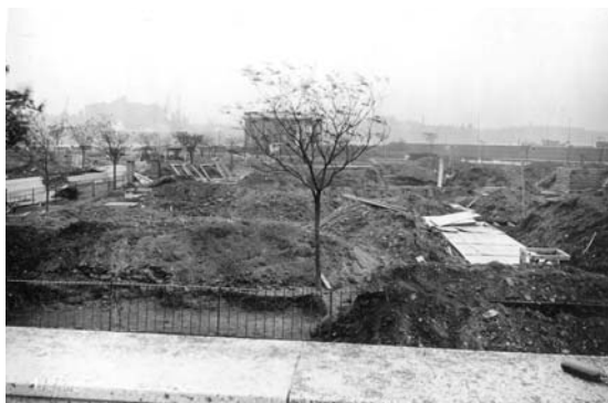
King Edward VII Memorial Park

A Year 6 class at Bluegate Fields School, Shadwell were fascinated by the images, maps and documents relating to their local area in the