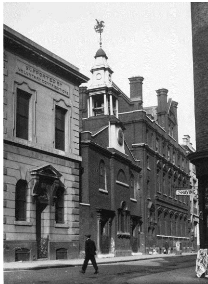
St George's German Lutheran Church was founded in 1762

This Grade II listed building in Alie Street, Whitechapel, is the oldest surviving German church in the UK. It contains an organ designed by the German pipe-organ manufacturer, Walcker, and many other remarkable original furnishings including a complete set of ground floor and gallery pews and a magnificent, high, central double-decker pulpit and sounding board.