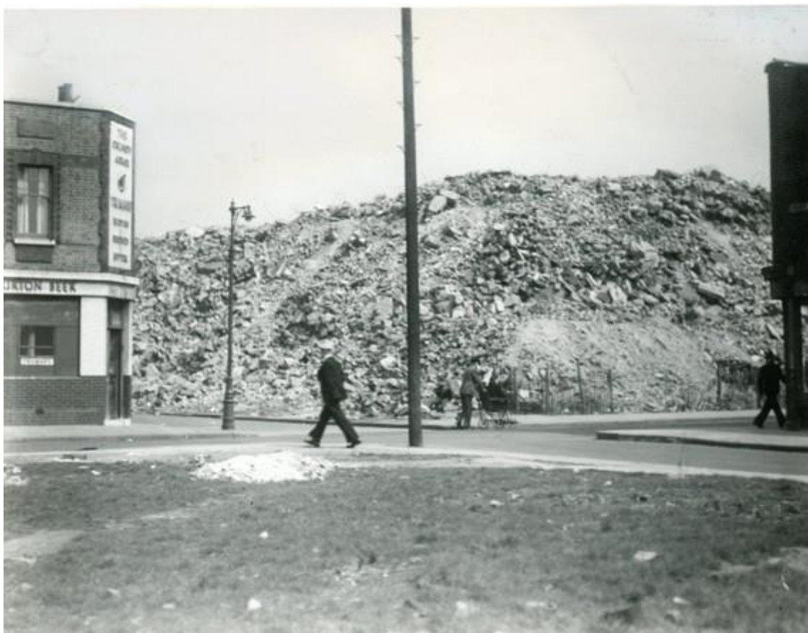
The Grundy Arms (left) still standing in 1950. Photo (c) THLHLA, ref no P08206

To browse the online catalogue please search for reference B/JSD in the Advanced Search menu and to look at material in person, pop into our Reading Room during opening hours.