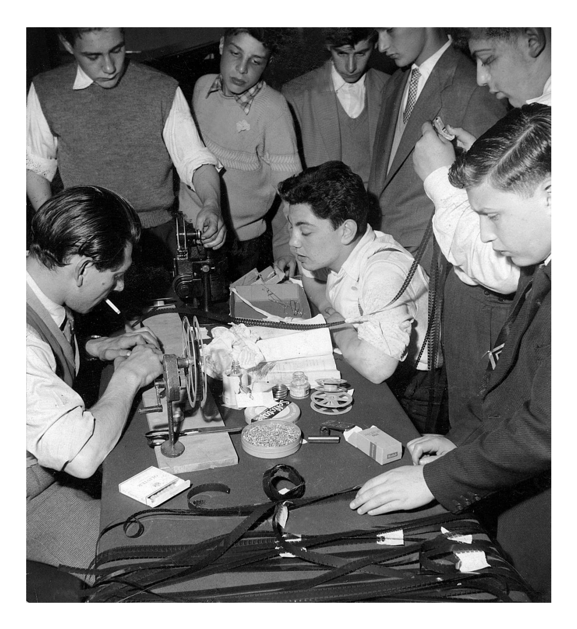
Exhibition | Friday 14 March - Saturday 21 June | Free

Venue: Tower Hamlets Local History Library & Archives