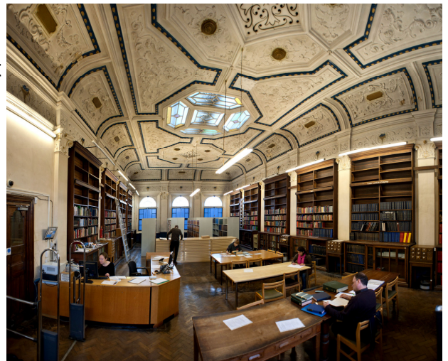
THLHLA's public reading room

In early November we took part in the Archives for London monthly seminar series ( http://www.archivesforlondon.org/ ) by hosting a talk here about our service and collections. Archives for London is an advocacy organisation representing the diverse range of archival institutions in London, their staff as well as keen users.