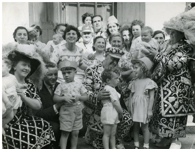
Coronation Party held on Jane St, Stepney, June 1953.

The photographs deposited include images of Cable Street School; Jane Street (demolished 1961); Harry Gosling School, Fairclough Street and Central Foundation Girls' School, Spital Square.