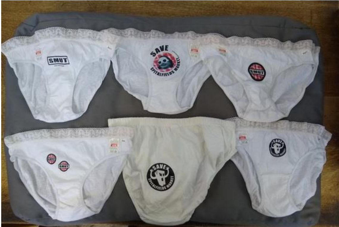
Promotional items produced by the SMUT (Spitalfields Market Under Threat) campaign, circa 2002. Ref no: SCA/3/2/9