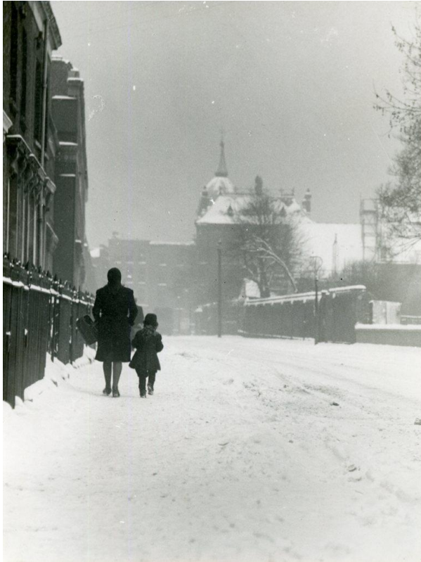
Woodstock Terrace, 1957, by William Whiffin

We have by popular demand produced a superb pack of postcards of photographs by William Whiffin which featured in our recent exhibition, Whiffin's East End . The pack of 12 postcards costs just £5 with £1 of the price going towards conserving Whiffin's photography collection.